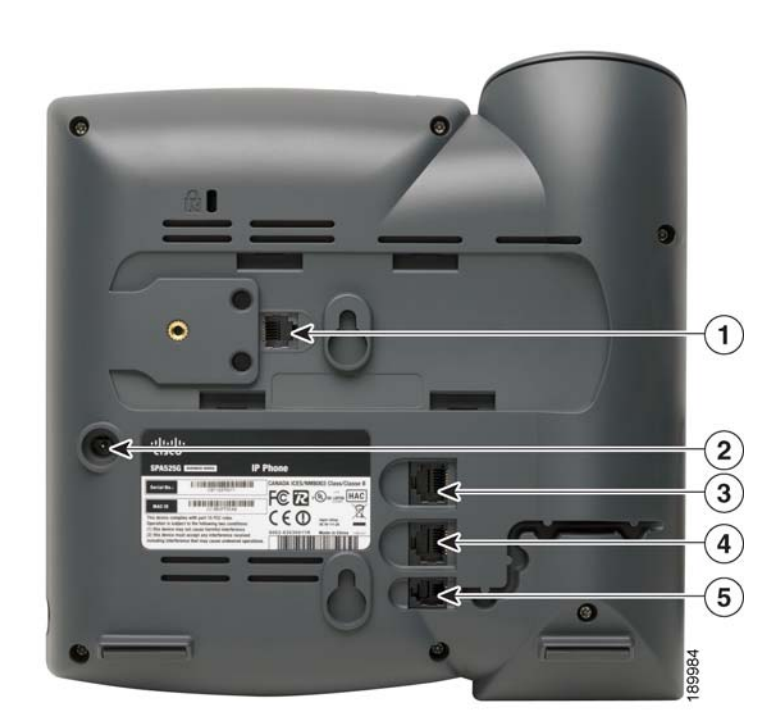
Figure 2 Cisco SPA525G and SPA525G2 IP Phone Connections