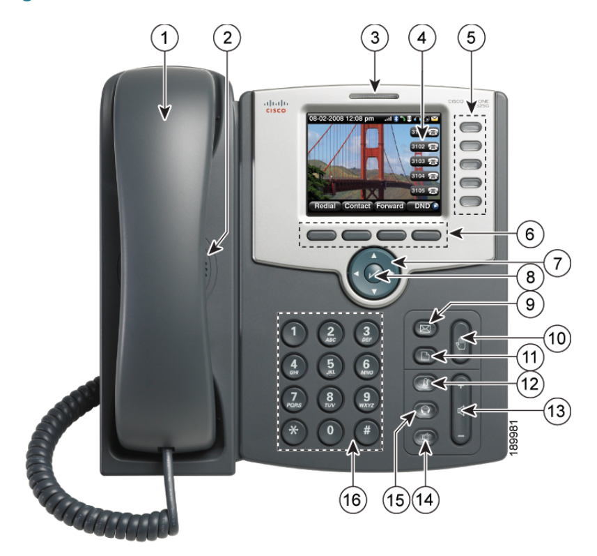
Table 1 IP Phone Components