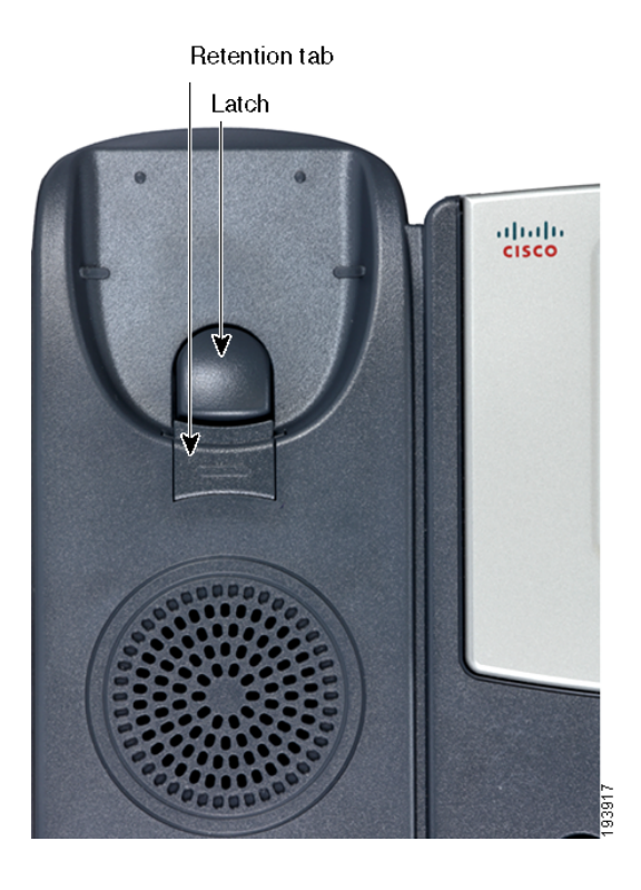
STEP 3 Rotate the tab 180° and re-insert into the phone base. The tab now catches the slot in the handset when the handset is placed onto the cradle.