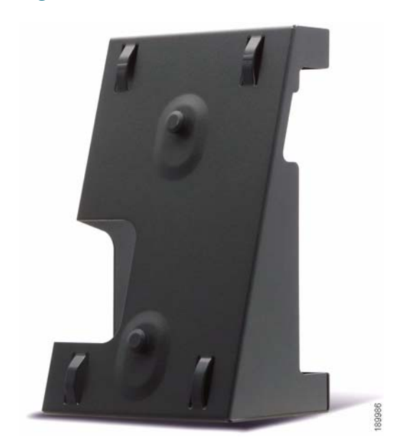
Figure 2 MB100 Wall Mount Kit

To mount the phone to the wall, you must use the MB100 wall mount bracket kit (available separately).